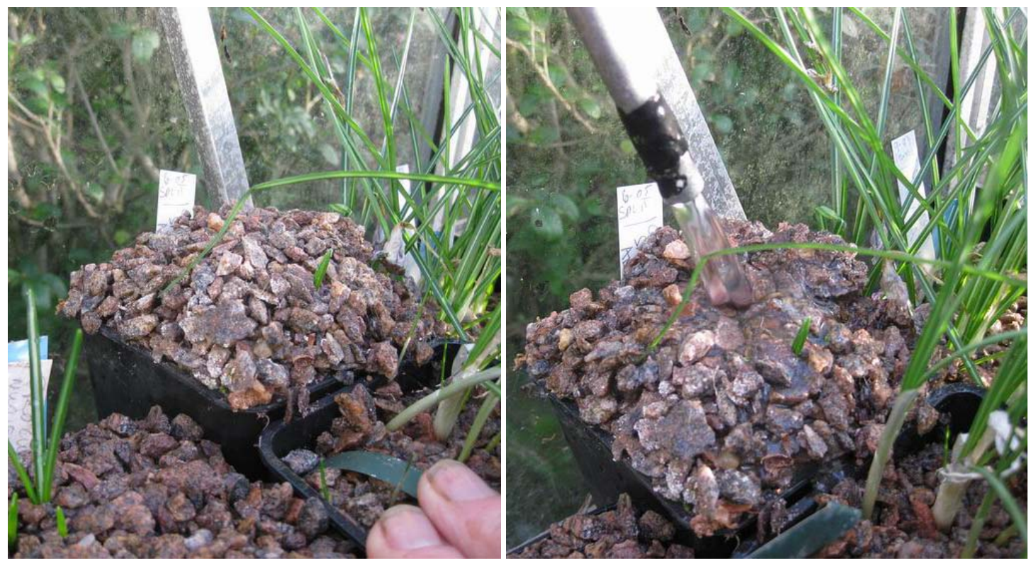
Eruption in pot

To the right is a plant of Cyclamen persicum which looked very unhappy during the cold and I was slightly worried by the limp leaves but it too has revived after a good watering as the picture on the right illustrates. This pot also sits on the unprotected plunge so it will be interesting to note how it has coped with the cold. If it survives unscathed then it will prove to those judges who when they come across C. persicum on the show benches just walk by pronouncing it as not hardy. I should point out that this plant was originally raised from seed of wild origin and it is not one of the many florists' selections that are offered by the thousands.