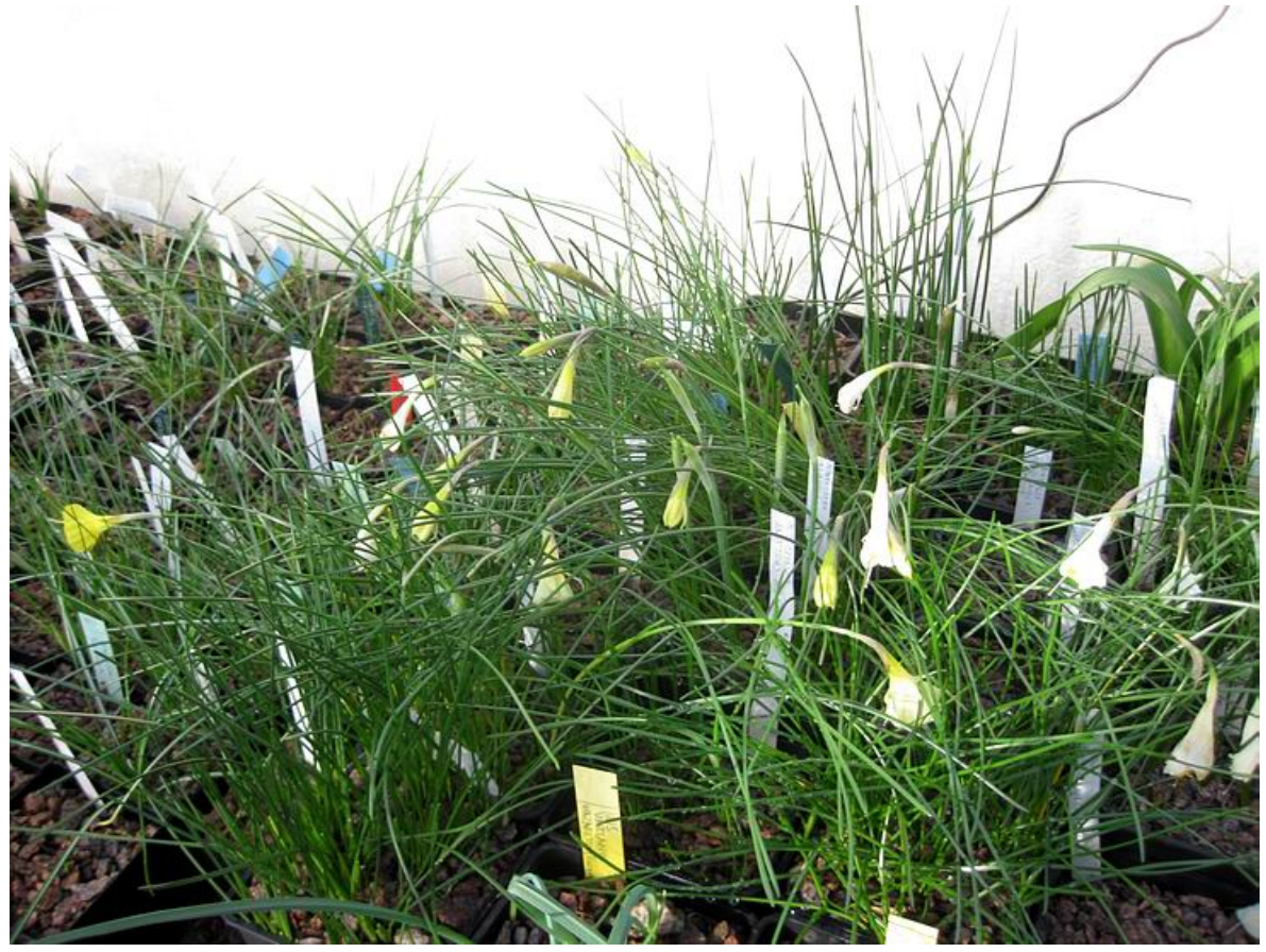
Narcissus flopping over

This picture shows the Narcissus stems and leaves flopping all over the place indicating they are short of water.