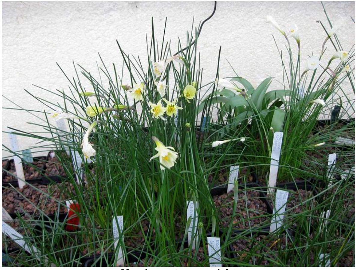
Narcissus stems upright

This picture shows the Narcissus stems and leaves flopping all over the place indicating they are short of water.