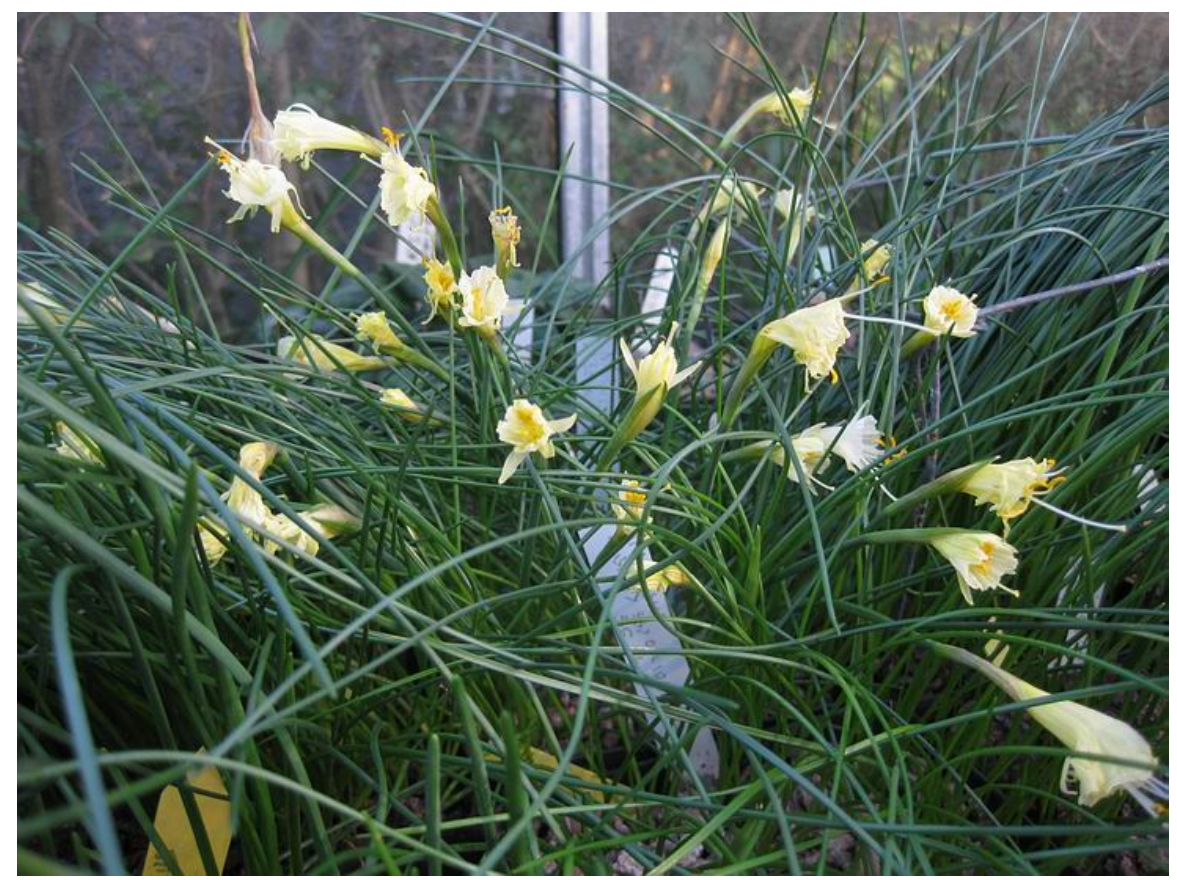
Narcissus 'Joan Stead'

The flowers on my pot of Narcissus 'Joan Stead' have not revived as well as I would have liked.