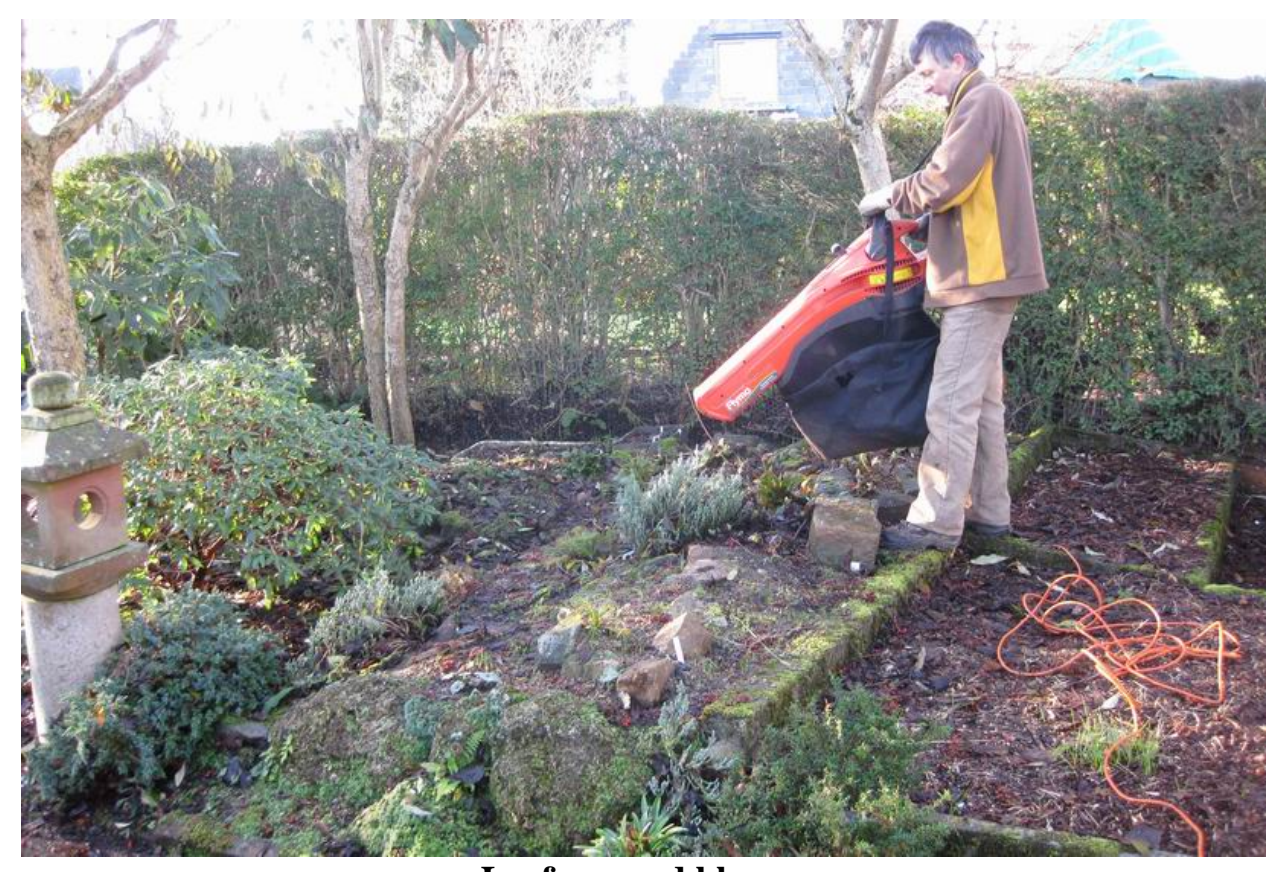
Leaf vac and blower

We have a number of Cotoneaster trees in the garden and they tend to hold their leaves right through until February or March unless we get a prolonged cold spell like we have just experienced. Now the snow has gone it is essential to gather up the leaves to reveal the paths again. The leaves are placed in our leaf mould heaps and will provide a valuable component of our potting compost.