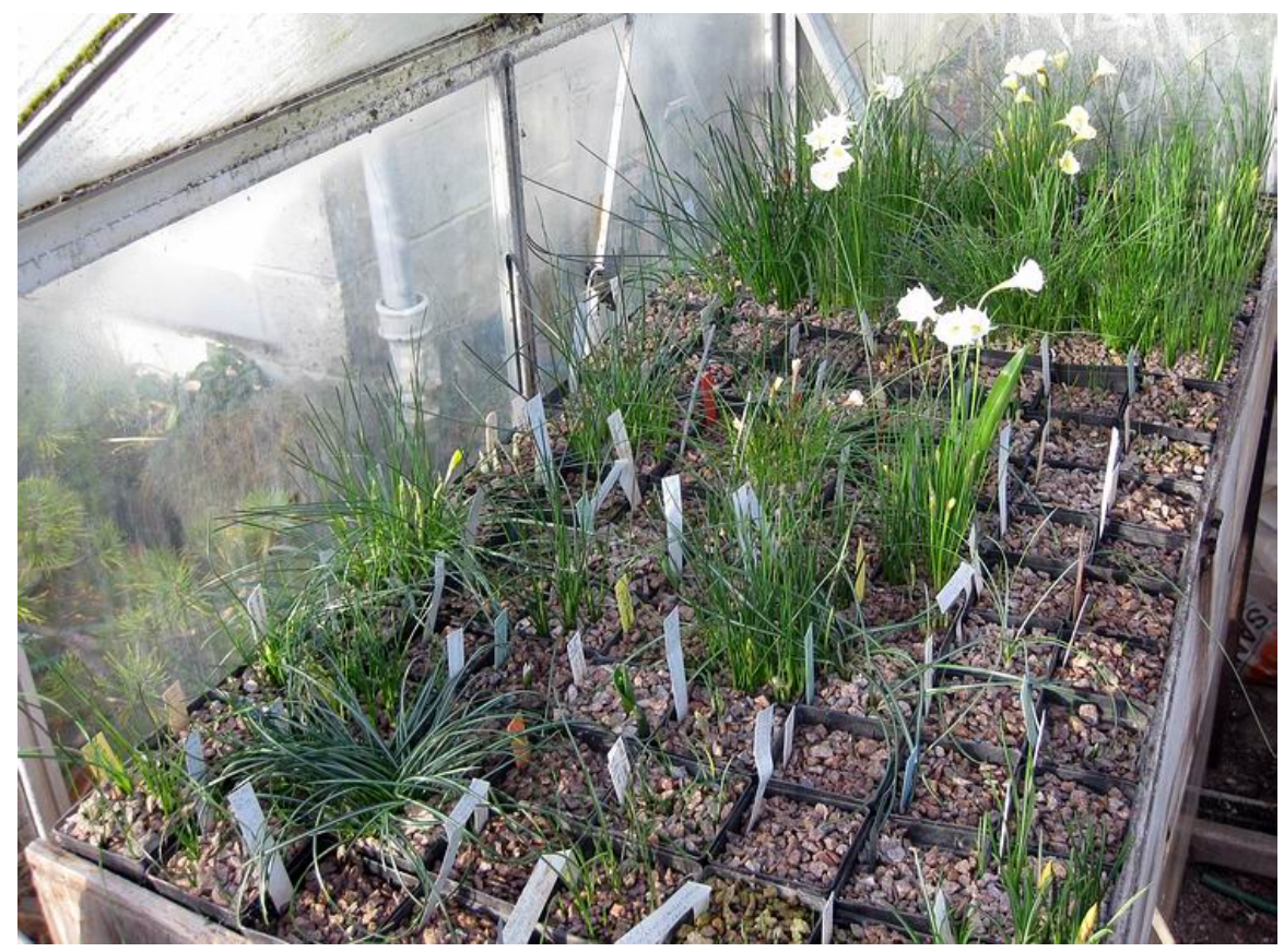
I was also able to check out how the bulbs in the bulb houses are looking now they are not frozen.

The snow has now gone and the sun came out on Sunday so I could have a good walk around and see what the garden and plants looked like without the snow and deep frost. It is always cheering to see the winter flowering shrubs such as Hamamelis x intermedia also heralding the start of another year.