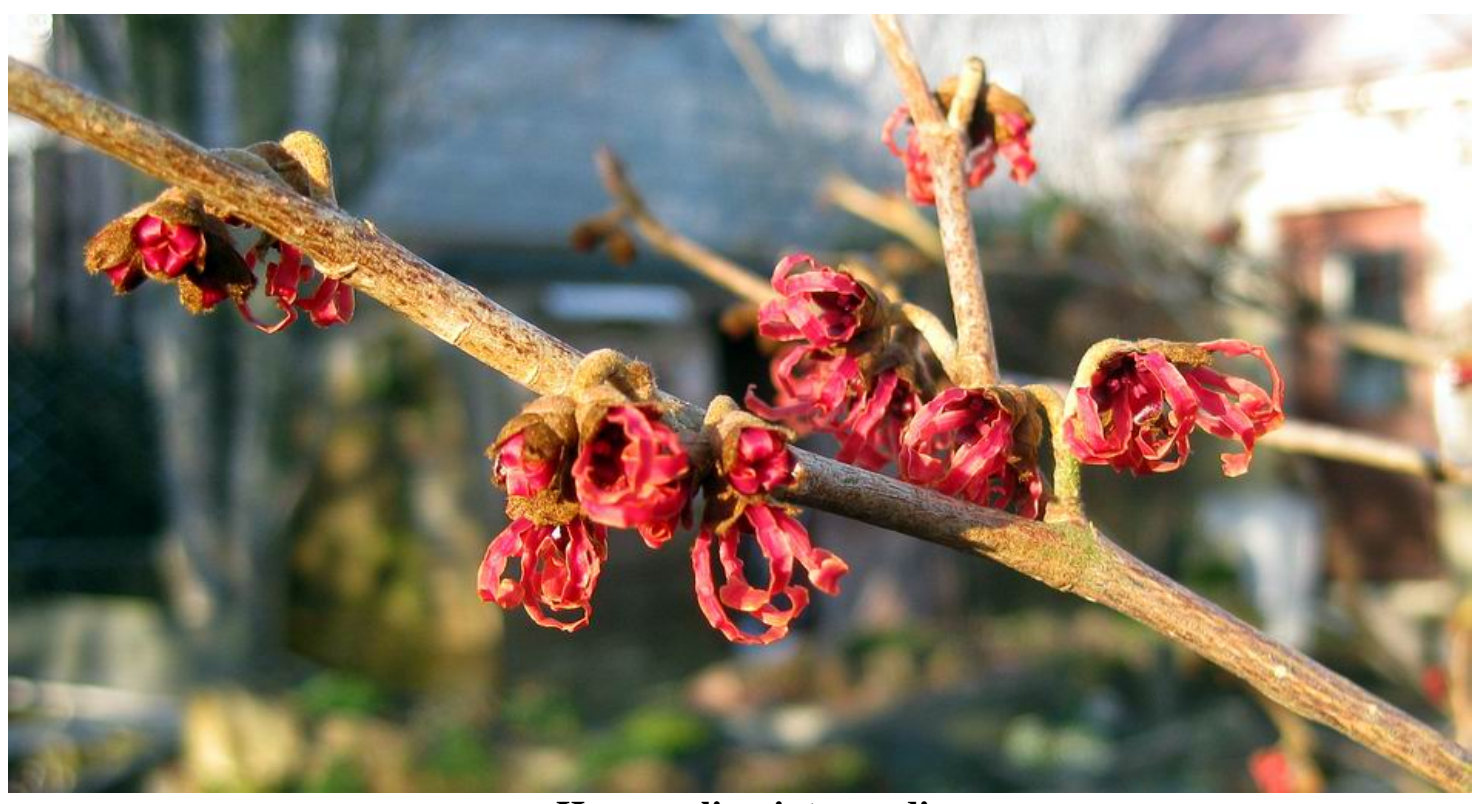
Hamamelis x intermedia

The snow has now gone and the sun came out on Sunday so I could have a good walk around and see what the garden and plants looked like without the snow and deep frost. It is always cheering to see the winter flowering shrubs such as Hamamelis x intermedia also heralding the start of another year.