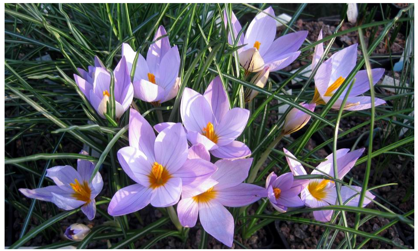
Crocus imperati suaveolens

It was not just me who was enjoying the brief glimpse of the sunshine and the warmth that it created in the bulb house but also some of the Crocus flowers were encouraged to display their beauty. Having been in bud for around six weeks now this pot of Crocus imperati suaveolens can now display its true beauty.