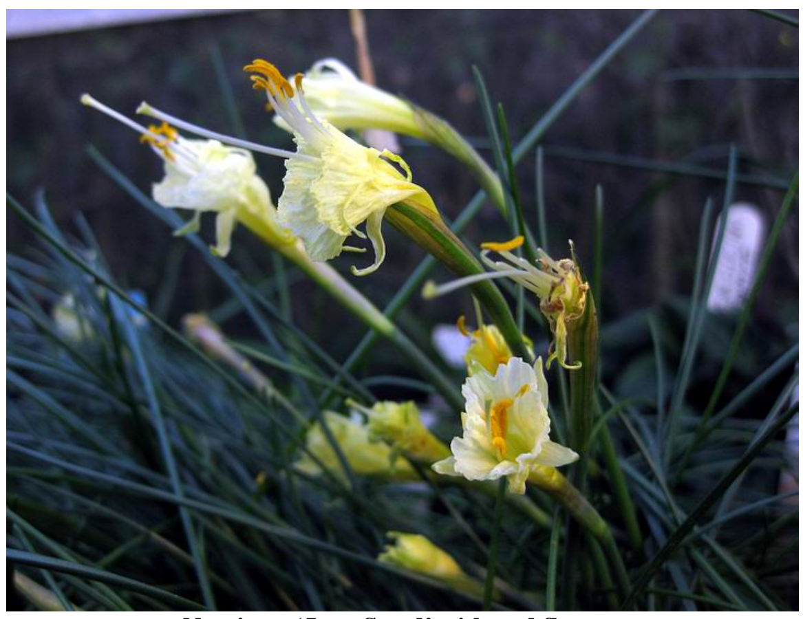
Narcissus 'Joan Stead' withered flowers

The flowers on my pot of Narcissus 'Joan Stead' have not revived as well as I would have liked.