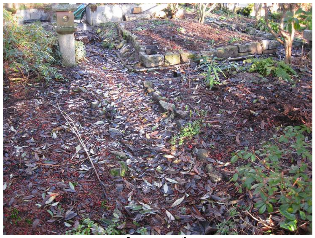
Leaves on path

Just compare this week's picture of Crocus michelsonii with the one I showed in last week's bulb log to see how quickly it has responded to the slightly raised temperature. Also I have noticed that now we are into the second half of January the daylight hours are starting to extend and the sun is getting slightly higher in the sky – it will soon be on the bulb houses for more than the forty minutes a day we are getting just now.