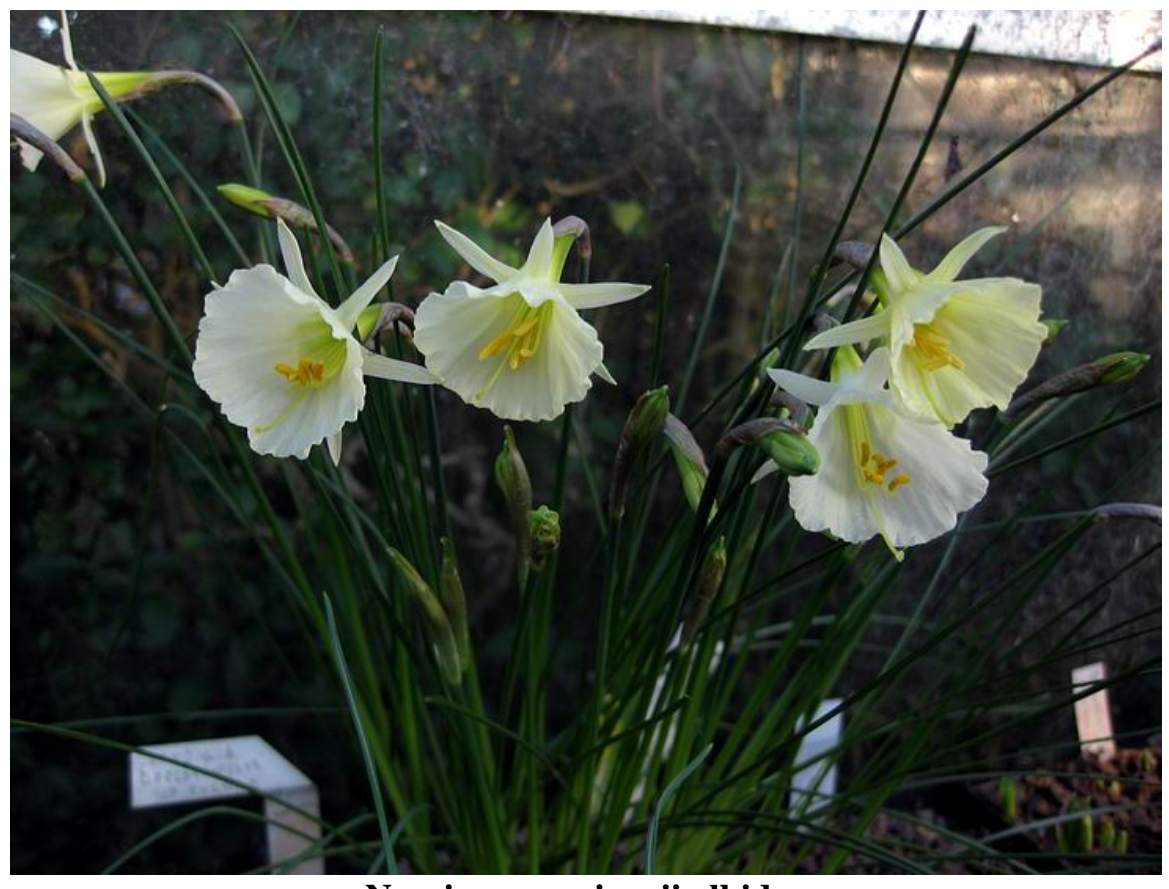
Narcissus romieuxii albidus

Different species as well as different genera have variable tolerance to freezing conditions.