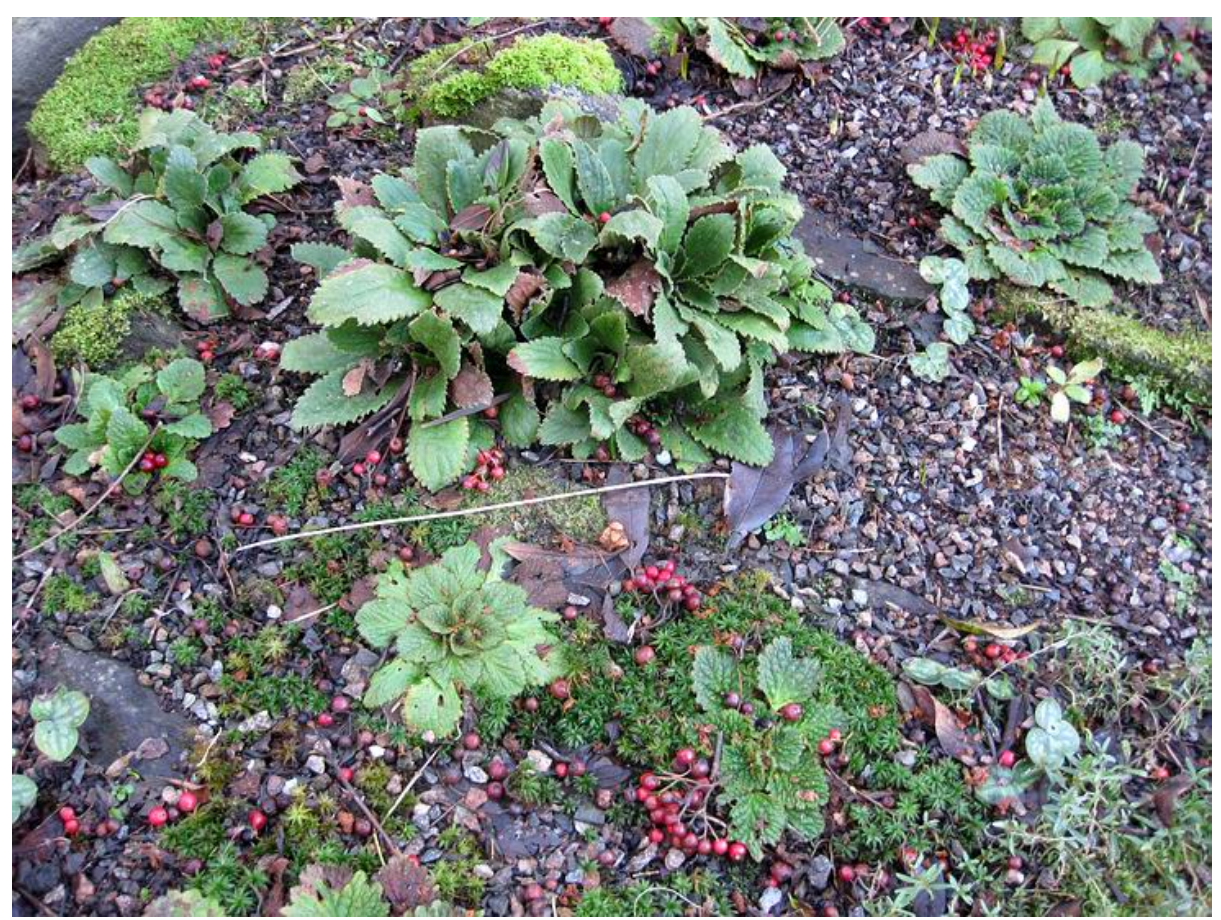
Haberlea and Ramonda

As well as a lot of bulbs this bed contains a lot of Haberlea, Ramonda and New Zealand plants so it is important that they do not become buried under the wet leaves for any length of time.